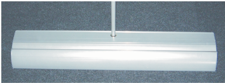
Remove the three part bungee pole from the base unit Construct the bungee pole and slot into the base unit