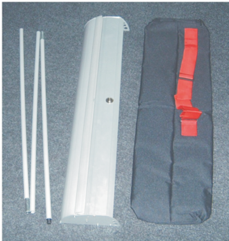
kit includes : bungee pole, top rail, base unit & carry case