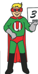
Finally secure the graphic into position by locating the top rail hole with the bungee pole